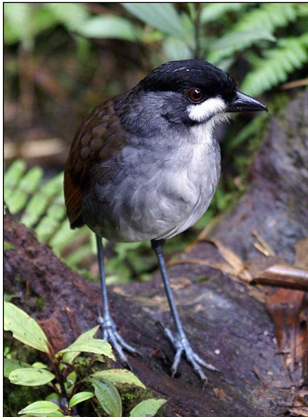
Jocotoco Antpitta - Tapichalaca

Two species of Umbrellabird under one umbrella!